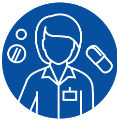
Opportunities to apply practice during learning