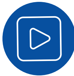
Videos/voiceovers to accompany slides